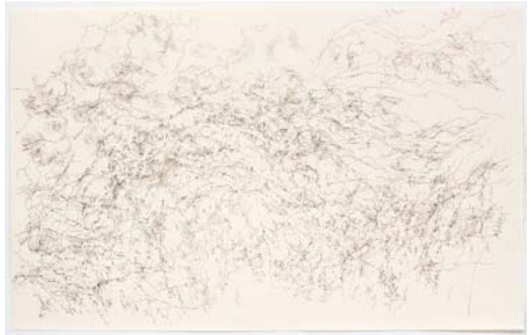
▲ Ann Kipling, June 23, 2009 . Pigma pen on rag paper.

Enter a world of magical landscape drawings by Ann Kipling of Falkland, BC. Ann draws layers of wiggly lines and scratchy marks to create large drawings that will remind students of aerial photos or topographical maps. Imagine you are flying above the landscapes. Where would you land? What would you do? Learn how Ann repeats these simple drawing marks to suggest trees and mountains and even the weather. Add your own marks to a collaborative landscape taking shape throughout the exhibition.