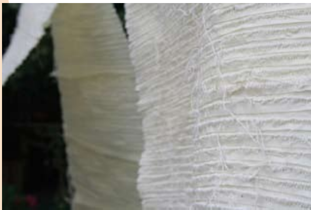
▲ Jennifer Bowes, In Silence , ongoing. Folded & stitched tissue paper.

Three more artists play with landscape and patterns using some very unusual materials in Beyond the Mountain . Jennifer Bowes repeats simple actions like folding or knotting or stitching or knitting for countless hours. She transforms everyday materials into special somethings. Dagmara Genda makes images of the landscape using sticky plastics, sometimes covering an entire wall. Sarah Alford creates lacy spider web patterns from hot glue. Each artist will open your eyes to the many forms art can take and the countless materials that one can use.