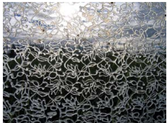
▲ Sarah Alford, Millefiore tapestry (detail), 2005. Hot glue, red foil, barbed wire fence & field.