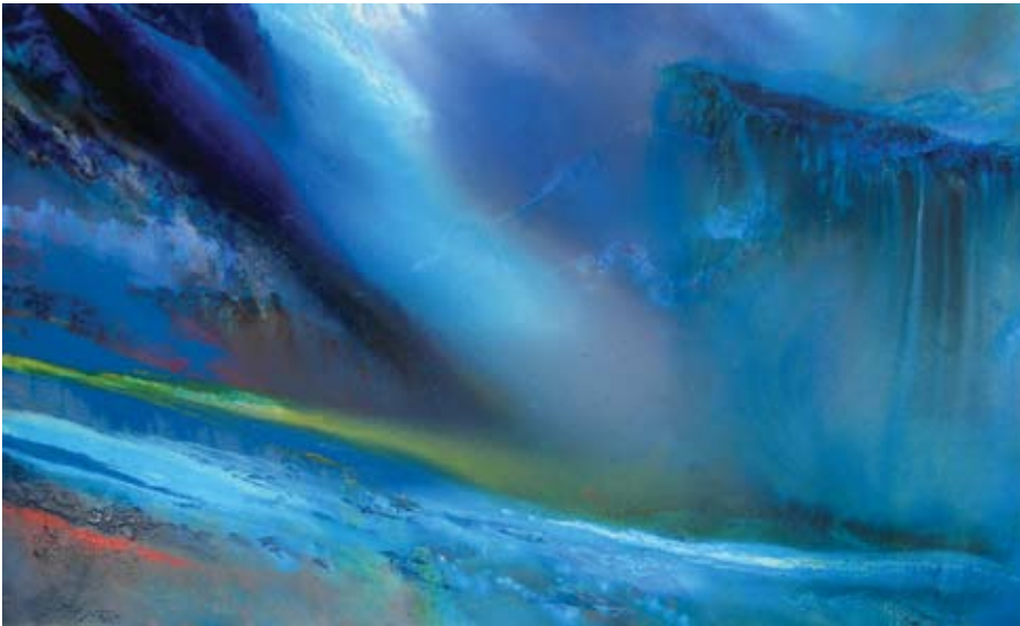
▲ Norman Yates, Landscape 232 . Acrylic on canvas.